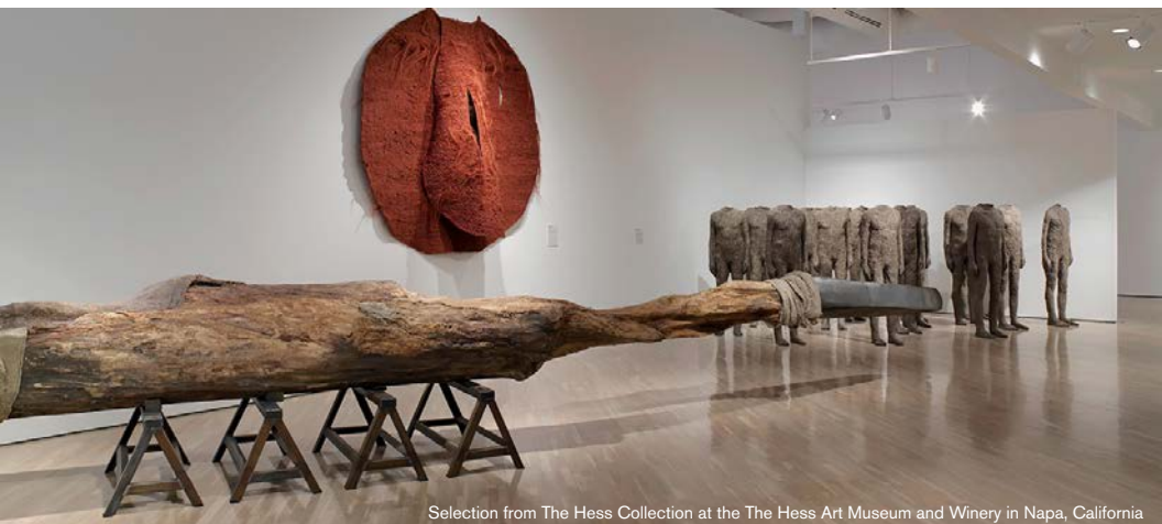
Selection from The Hess Collection at the The Hess Art Museum and Winery in Napa, California

Join Art Encounter for an exciting adventure in the visual arts, along with great cuisine and wine in the Bay Area and Napa Valley. We will begin in San Francisco with visits to the newly expanded San Francisco Museum of Modern Art which closed for 3 years in order to triple its exhibition space. Beautifully integrated with the original building designed by Mario Botta, the museum now has impressive on-going exhibits by the world's major modern and contemporary artists. Take this opportunity to see blockbuster shows of Gauguin and late period Monet in the elegant de Young Museum situated in the beautiful Golden Gate Park. Meet artists and art collectors to get an inside view of the city's unique vision. Across the bay, in Oakland, we will visit an artist in her expansive home studio as well as a collection in the Oakland Hills. Then on to Napa Valley to stimulate our eyes and our palates in wineries with art collections ranging from cutting edge to decorative.