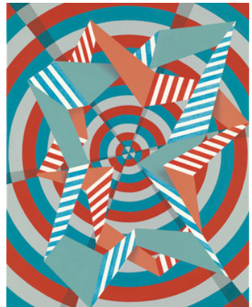
Untitled from Tomma Abts at the Art Institute Chicago

Tomma Abts delves into rigorous abstract paintings that build on geometric relationships and colors to create shifting spaces that appear to be both ordered and random. The works created in acrylic and oil are heavily layered adding visual weight to the hard edged shapes. A winner of the coveted Turner prize in England, the German artist is now based in London. Then, we'll explore newly installed art in the contemporary galleries.