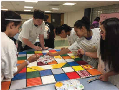
Students at Old Orchard Jr High School