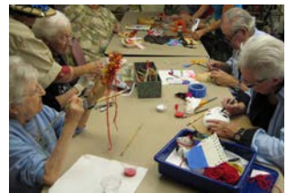
Residents working on masks for Hats Off to Art.

In Hats Off to Art, seniors in assisted care facilities and nursing homes mine their own experiences to create expressive representations of who they are. Our teaching artists provide meaningful opportunities for everyone to tap into their potential for self-expression and engage socially with peers, as they explore painting, drawing, sculpting and mixed media activities together. Their artworks are displayed at a culminating reception where friends and family celebrate their artistic achievements.