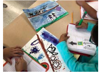
Students at Old Orchard Jr High School

We are thrilled to continue our partnership with the local youth development organization Y.O.U., providing art enrichment at their after school program sites. This year, we are working with several different elementary and middle schools in Evanston and Skokie, leading arts workshops that include drawing, painting, and mixed media.