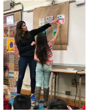
Washington School art teacher and student discussing her work.