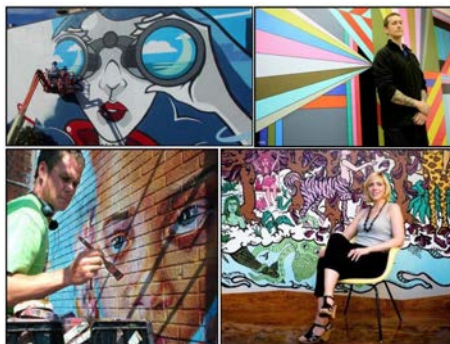
2018 EMAP Artists

Follow these projects via @evanstonmuralartsprogram on Facebook and Instagram.