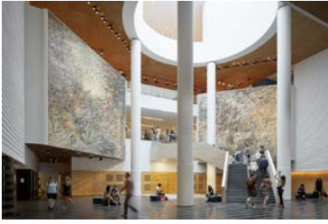
Murals in the lobby of SF MOMA