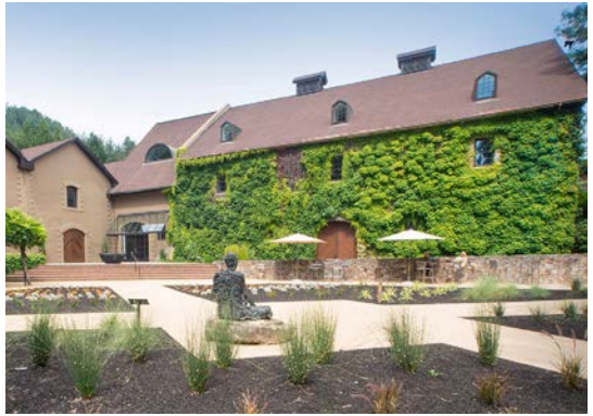
Garden at The Hess Art Museum and Winery in Napa, California