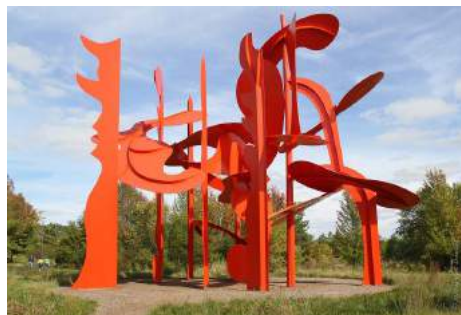
Frederik Meijer Sculpture Garden

PRICE: $1890 per person + $399 single room supplement*