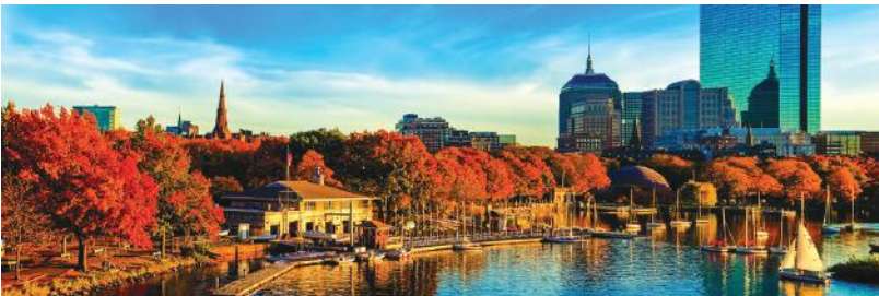
The beautiful Boston skyline in autumn