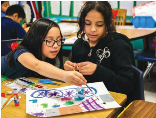
Students participating in our ARTiculations program

Art Encounter programs bring creativity and connection to adults residing in senior living facilities through hands-on and discussion-based programs of artworks from our professional collection. Through engagement with the arts, our workshops provide cognitive stimulation, motor coordination, and joy to seniors in the Chicago area with limited resources. In 2019-20, we are partnering with Westminster Place, Buckingham Pavilion, Embark, and Greenwood Place to bring our Hats Off To Art and Making for Memory programs to their residents.