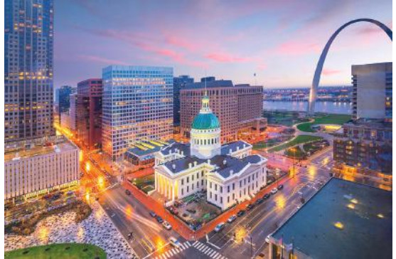
St. Louis, Missouri at dusk