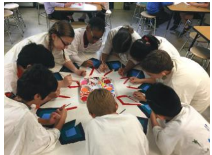
Students working on a recent mural project

PRICE: $262.50 for residents, $275 for non-residents