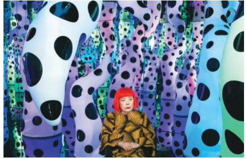
Yayoi Kusama at the ICA Boston