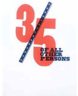
3/5 of All Persons by Ben Blount

PRICE: $22 for Art Encounter members, $25 for non-members