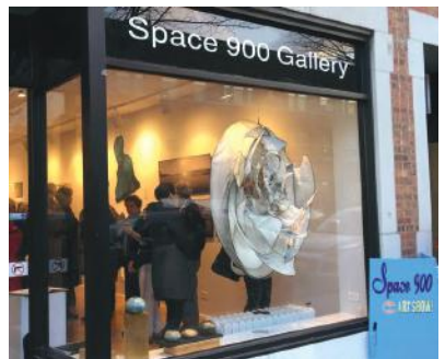
Space 900 Gallery in Evanston

■ ■ ■ ■ Visit artencounter.org for more information about Nurturing Creativity.